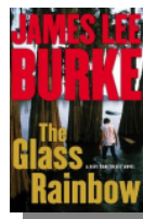
The Glass Rainbow By James Lee Burke