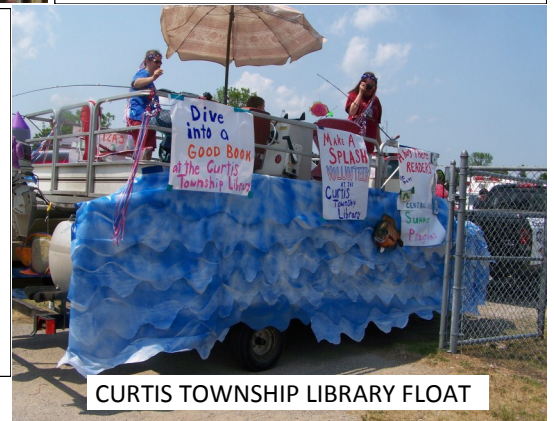
CURTIS TOWNSHIP LIBRARY FLOAT